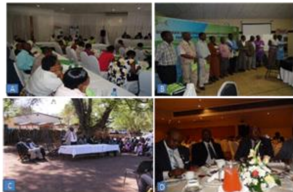
Figure 2 Platform Participants, (A) attendants during Platform launching; (B) workshop participants; (C) shows Kgotla meeting; (D) breakfast seminar for Honorable Members of Parliament

1 Kgotla is the traditional meeting place in Botswana