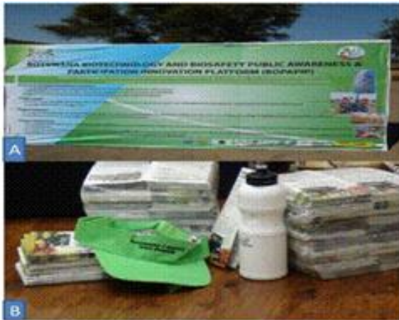
Figure 3 Materials used during the campaign, (A) educational poster; (B) promotional materials and brochures used during Public Awareness Campaign

Policy was successful passed during the June, 2013 Parliamentary Session.